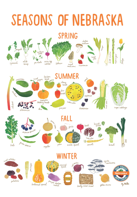
The Seasons of Nebraska print is an educational resource to teach about seasonality of Nebraska produce.

Holiday Gift Guide 2021 featured 16 Nebraska-grown products, perfect for a holiday meal or to give as gifts. A shopping guide, but also an educational tool - used to teach about the variety of seasonal Nebraska-grown goods.